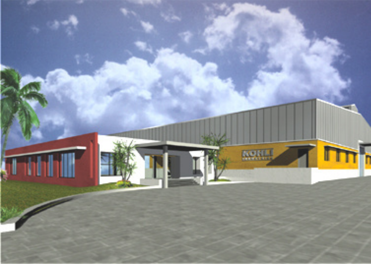
Our New Factory Near Mumbai, India.